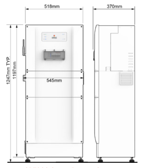
SB7200 Smart Battery System